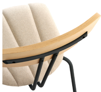
ISB + OSB Wood