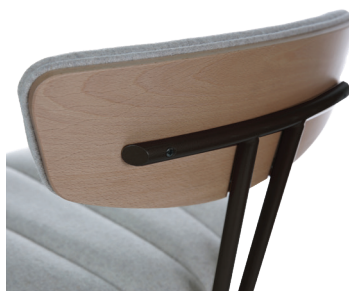
ISB Uph + OSB Wood