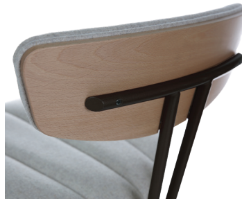
ISB Uph + OSB Wood